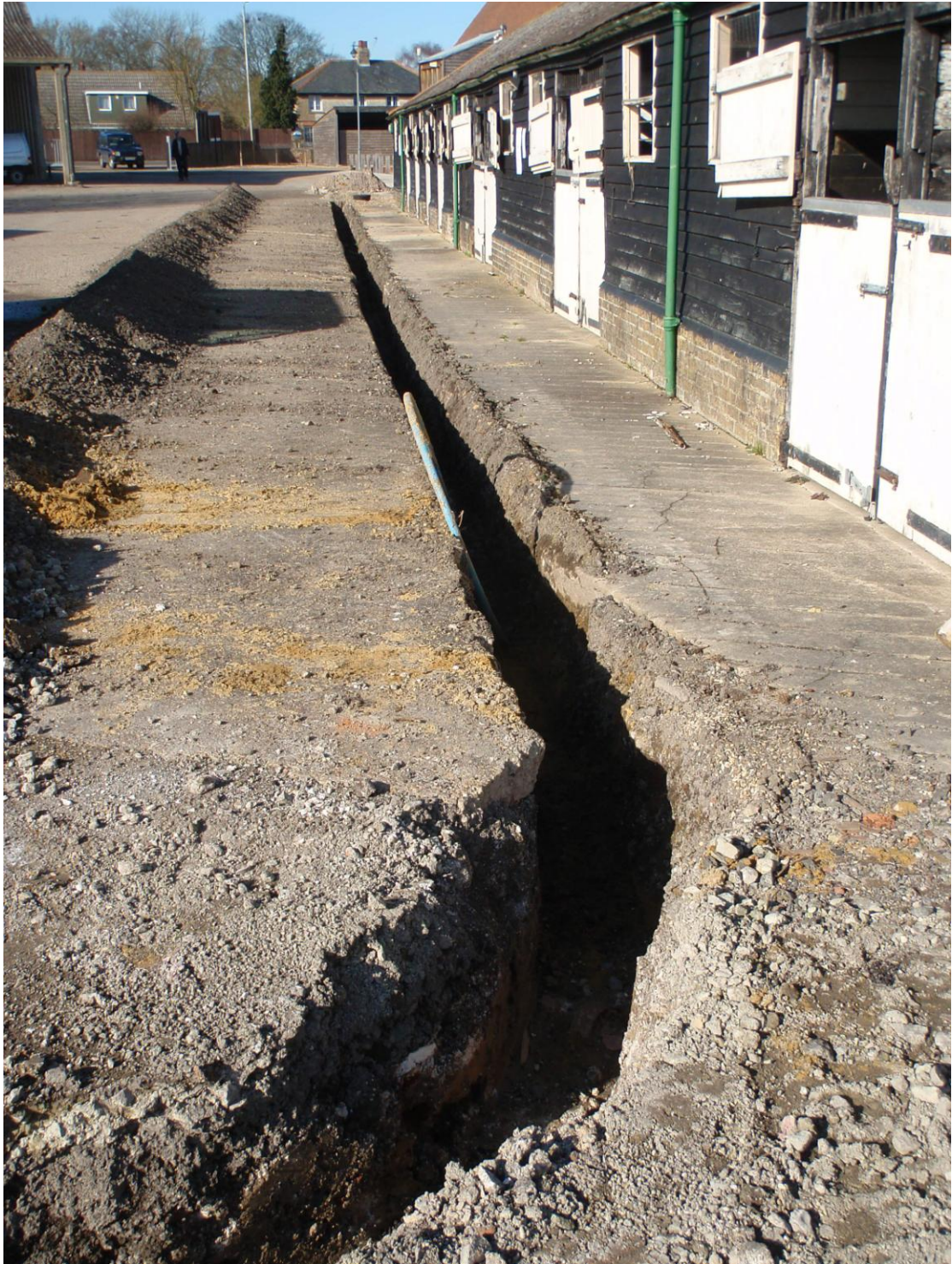
Plate 2. Showing excavation for cabling (facing north-west)