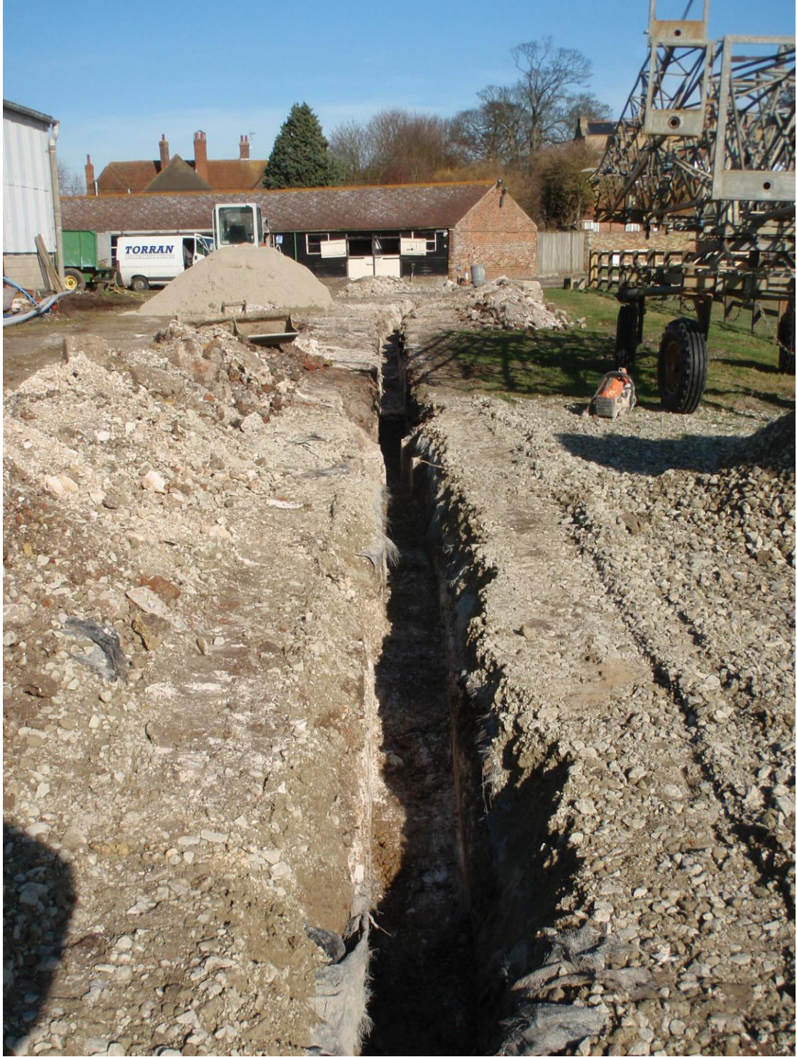
Plate 1. Showing excavation for cabling (facing north)